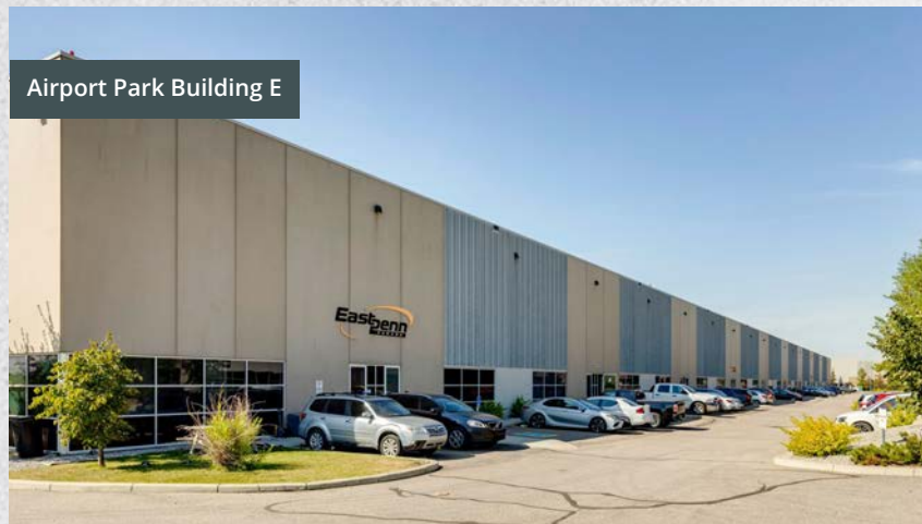
Airport Park Building E