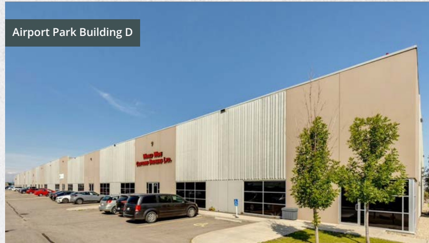
Airport Park Building D