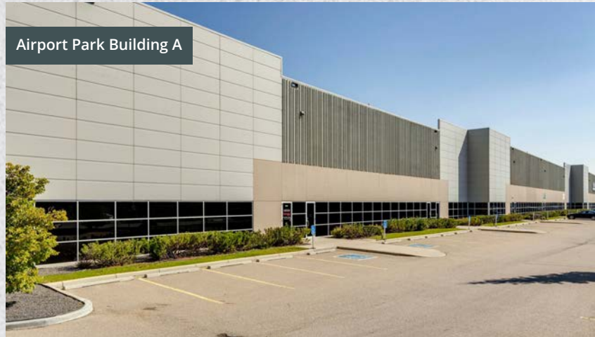
Airport Park Building A

Airport Business Park is situated at the Northeast boundary of the city providing quick access to the QE II. The Property has visibility to Barlow Trail and Country Hills Boulevard NE and is a short distance from Deerfoot Trail, Metis Trail and Stoney Trail NE. Located directly North of the Calgary International Airport with various food and beverage establishments and ample new format industrial-distribution development within close proximity. The Park caters well to small and mid-bay distribution type businesses.